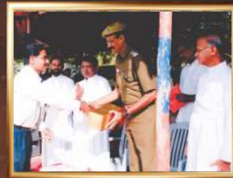
Sports Day 2008