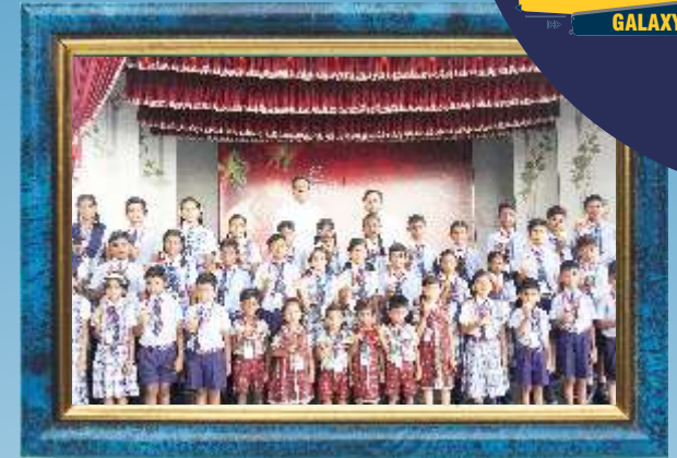
IQ 23 - Science Expo Winners