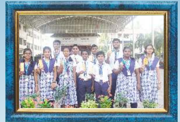
HYGGE 2023 - Inter School Competition Winners