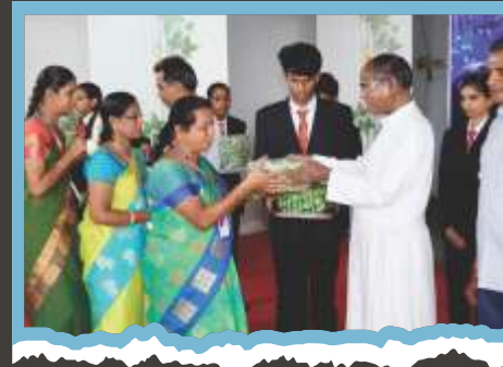
'Guru Vandana Teacher's Day Celebration