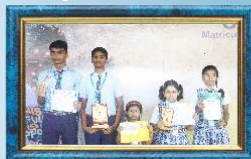
District Level Chess Winners