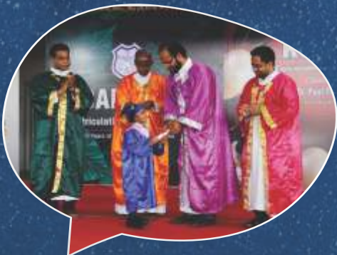
Kindergarten Graduation Ceremony