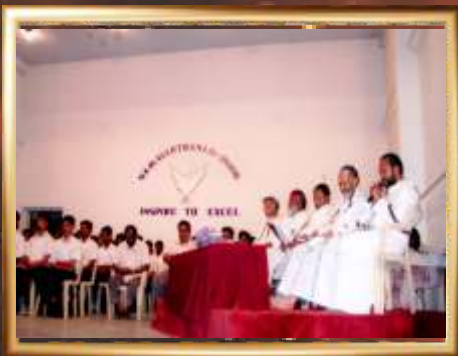
Samavarthanam for the outgoing Students of Grade XII in 2006