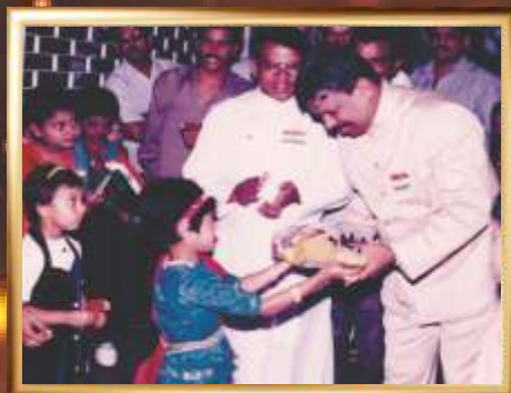
Republic Day Celebration in 1990