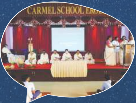
'Samavarthana' - Adieu to Grade XII