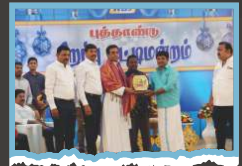
Best School Award from Raj TV