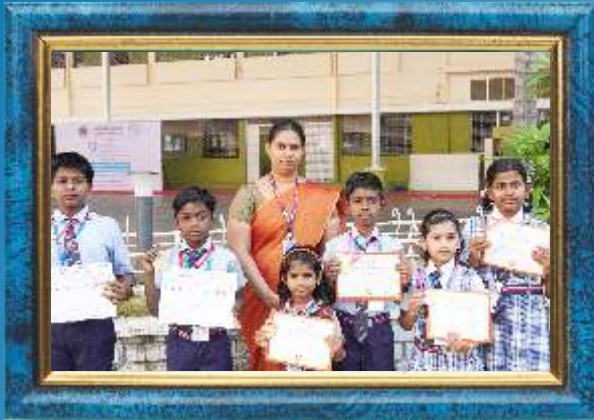
Art, Essay & Silambam Winners