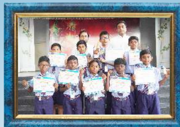
State Level Skating Champions