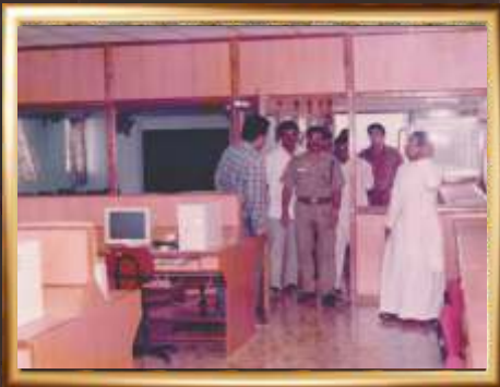
Inauguration of Computer Lab