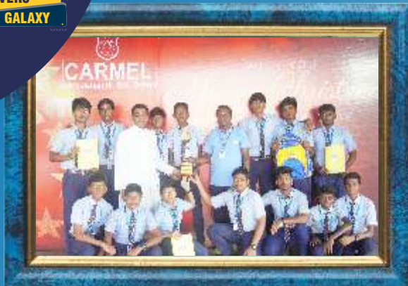
Junior Super Kings Cricket Winners