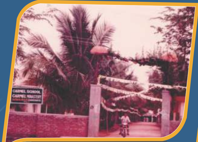
School Entrance in 1982