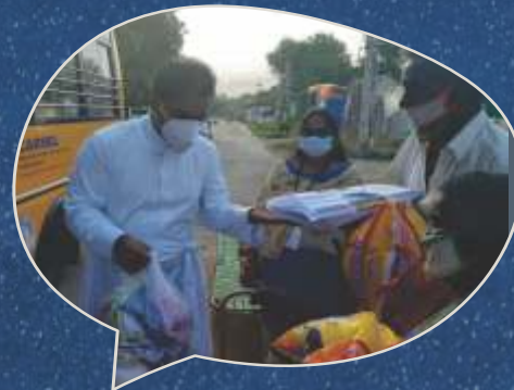
Carmel C-Hands Social Service Scheme