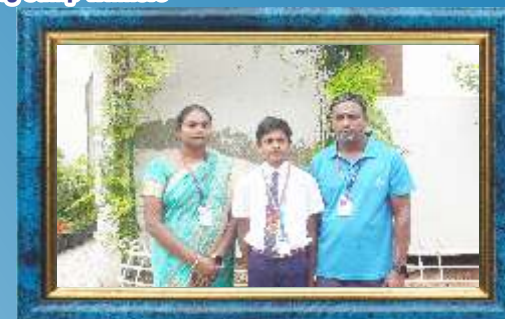
District Level Basket Ball Winner U-14