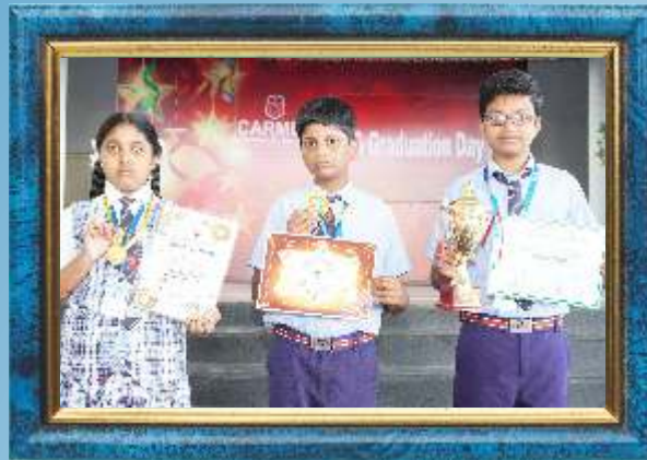
Art, Chess & Thirukkural Winners