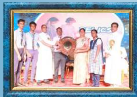
Whistle - Housewise Overall Championship