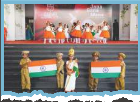
'Jana Gana Mana' - I Day Celebration