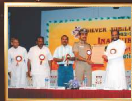
Inauguration of Silver Jubilee in 2007