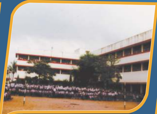
School Building in 90s