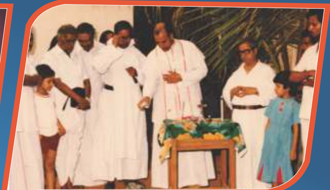
Laying of Foundation Stone