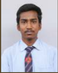
Master Sanjay K XA The Winner Rack Your Intellect