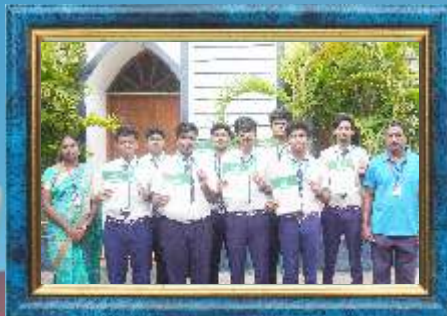
District Level Basket Ball Winners U-19