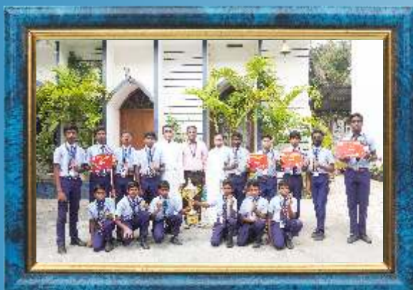
District Level Cricket Winners U-15