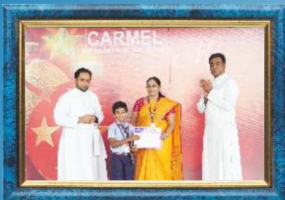
Athletic Medalist U-17