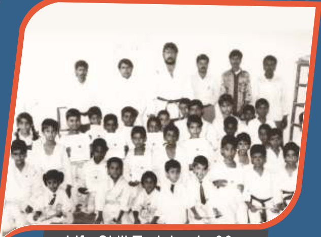
Life Skill Training in 90s