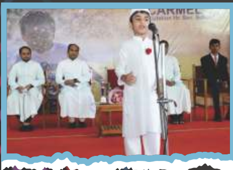
Children's Day Celebration