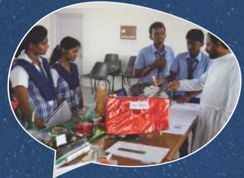
Science Expo 2018