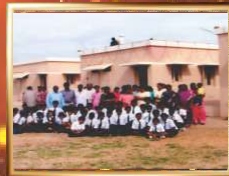
Houses for the needy Carmel's Social Scheme