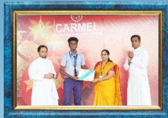
District Level Taekwondo Champion