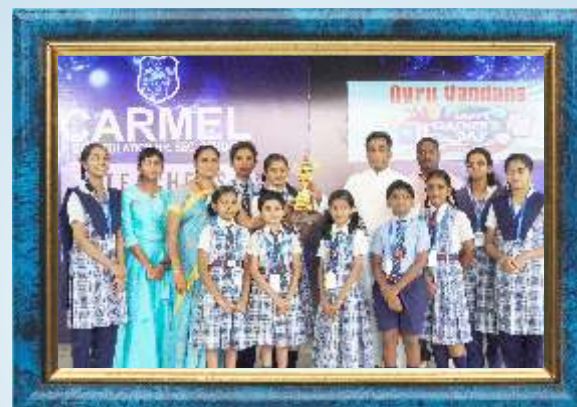
HYGGE 2022 - Inter School Competition - Overall Championship