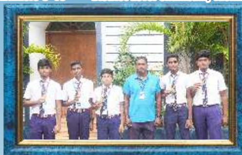
District Level Cricket Winners U-16 & 19