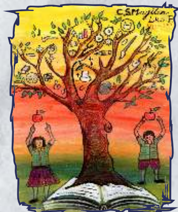
Master Magilan C S LKG B