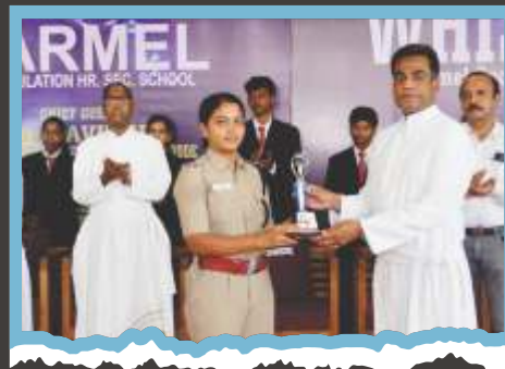
'Whistle' - Annual Sports Meet