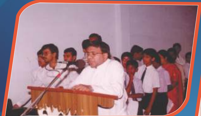
Award Day 1990