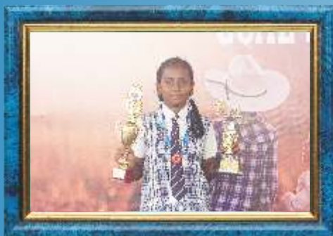
State Level Silambam Winner