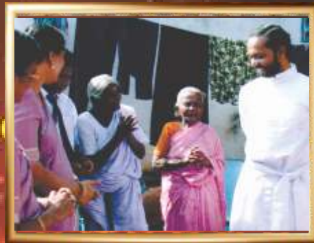
Reaching out to The People