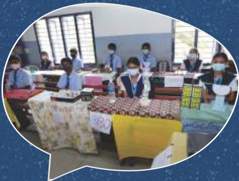
Carmel Ruby Expo-2022