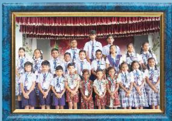
Star Performers of KG to Grade XII