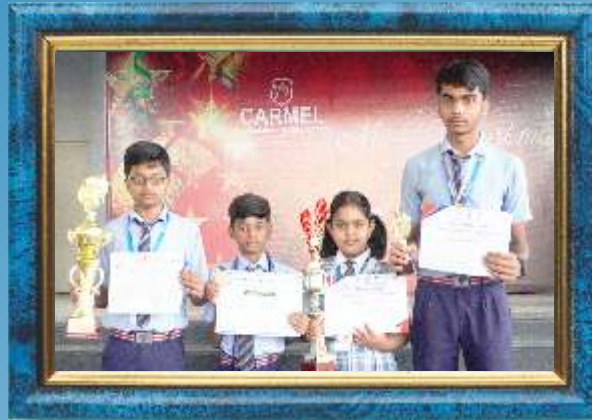
Chess & Football Winners