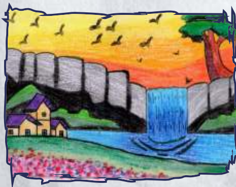
Master Messi Melvin L III A