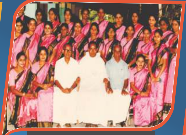
First Batch of Teachers