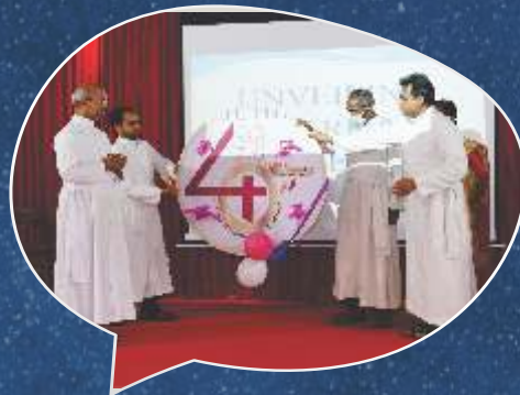
Unveiling of Ruby Jubilee Logo