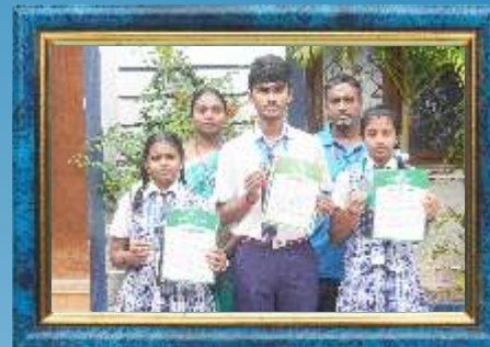
District Level Silambam, Taekwondo & Long Jump Winners