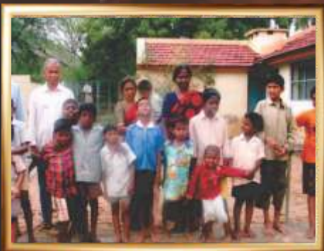
Rev. Fathers @Udhayam Special School Chennimalai