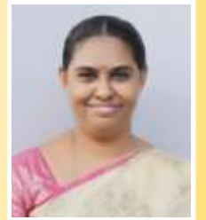
Mrs. Vigila S

PUZZLE TIME INITIAL NUMBERS Each number has some initials after it. Just work the initials means as the numbers are the clues For example: 7 D in a W is 7 Days in a Week 1. 26 L in the A 2. 7 C in the R 3. 1000 M in a K 4. 64 S on a CB 5. 28 D in F 6. 24 H in a D 7. 8 L on a S 8. 52 C in a P 9. 93 MM to the S 10. 366 D in a LY 11. 1760 Y in a M Answers: Letters in the alphabet Colours in the rainbow Meters in a kilometer Squares on a chess board Days in February Hours in a day Legs on a spider Cards in a pack (no jokers) Million miles to the sun Days in a leap year Yards in a mile