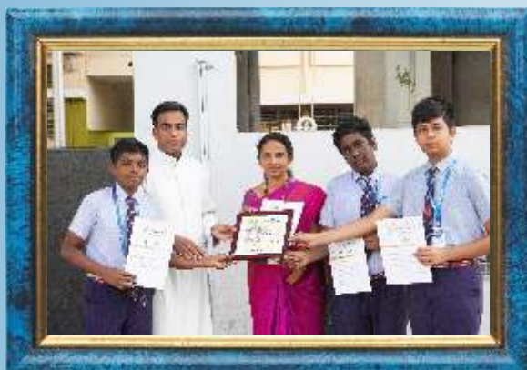
Wipro Earthian Regional Winners