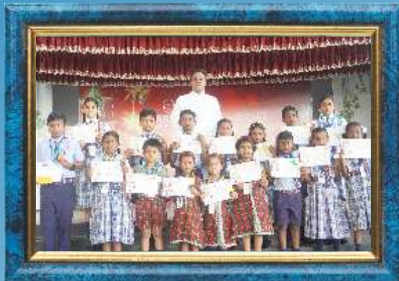
Children's Day Drawing Competition Winners