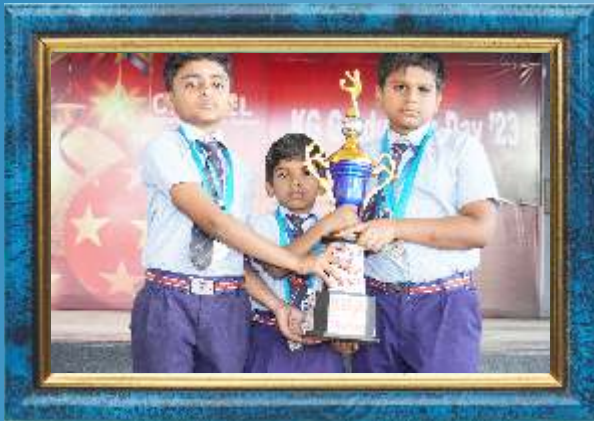
Football Champions U-9