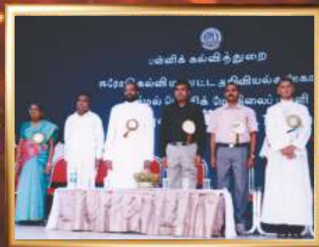
Erode District Science Exhibition in 2004