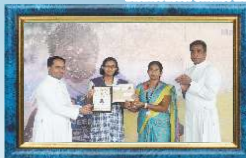
St. Chavara Exemplar Award – 2022