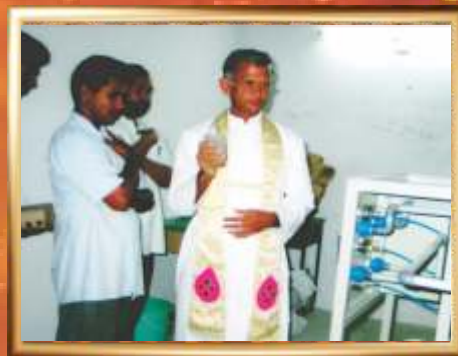
Blessing of Water Purifier