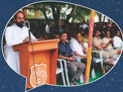
Sports Day 2015