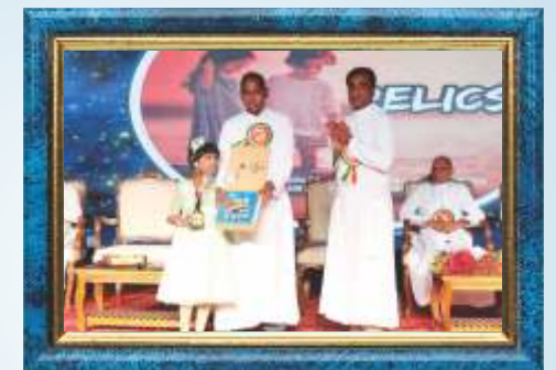
Indian Book Record Holder