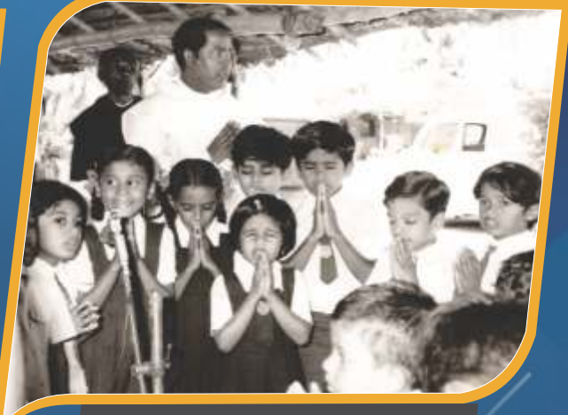
School Assembly in 1982