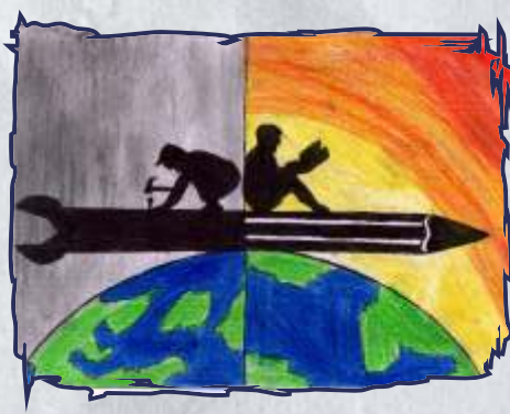
Master Santhosh S VIII B