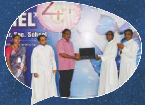
Launching of Carmel Website