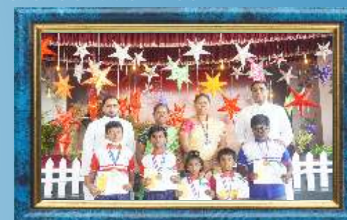
National G.K Olympiad Winners