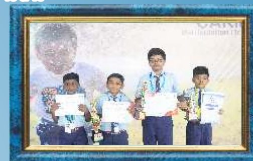
District Level Karate Winners