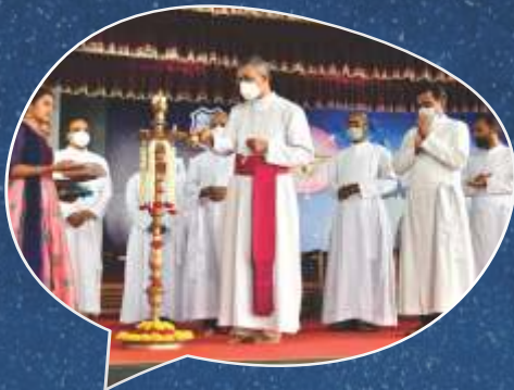
Ruby Jubilee Inaugural ceremony